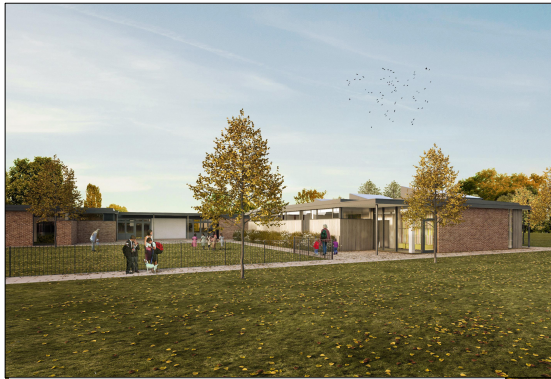
3D View showing rear of proposed three classroom block