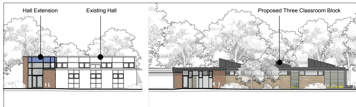
Proposed school hall extension west elevation