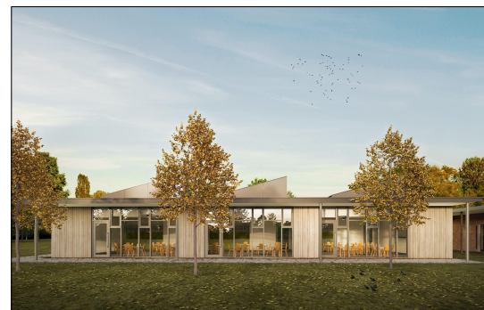
3D View of east elevation